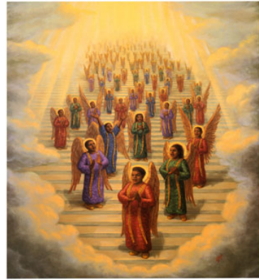
A GOSPEL CHOIR OF ANGELS BY ANNAS